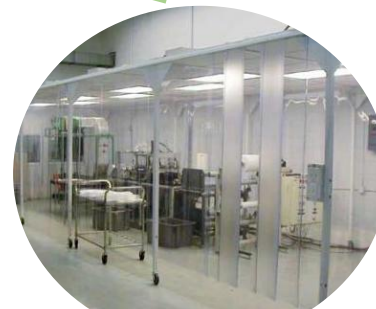
Powder Coat Room