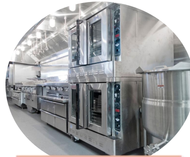
Food Service Equipment