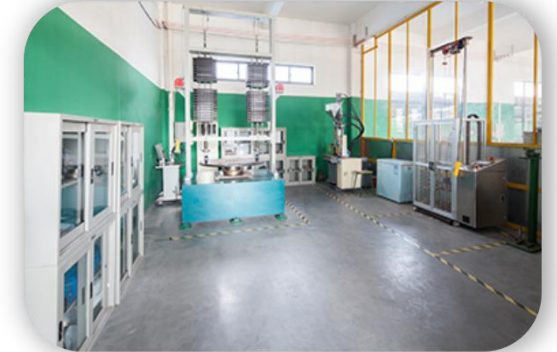
Caster Walking Tester