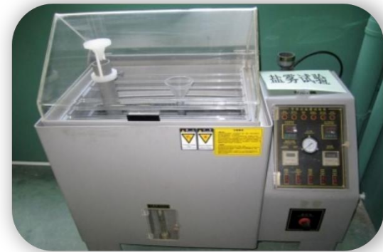
Salt Spray Tester