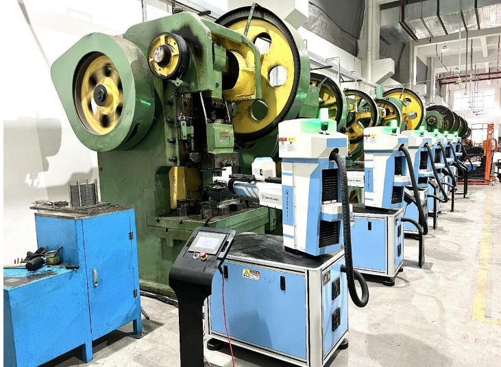
Automatic Stamping Line